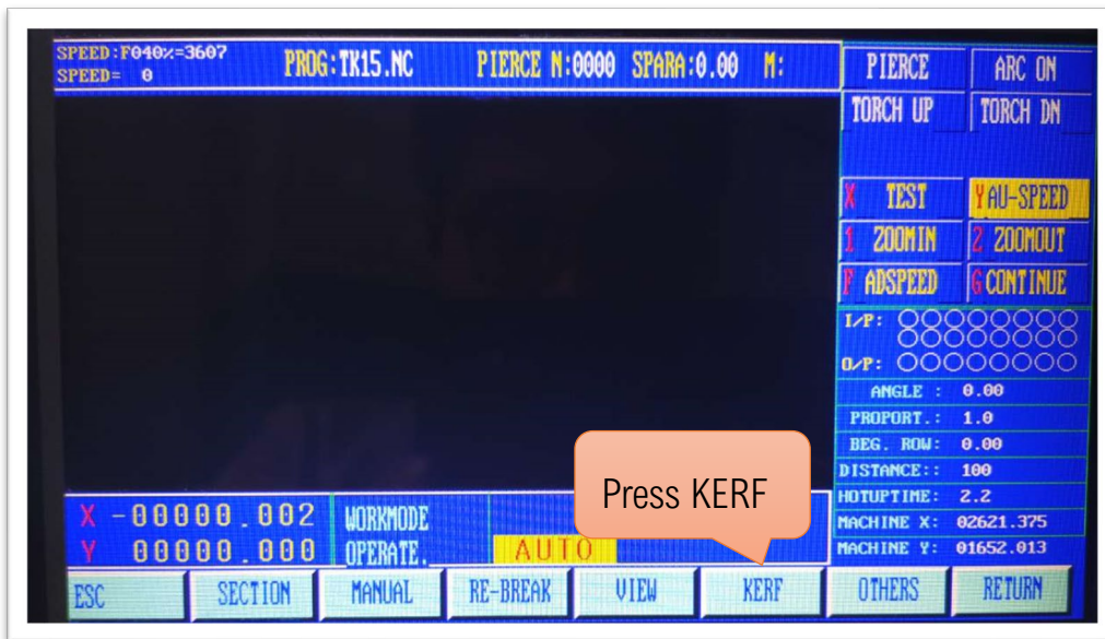
Pic1 the automatic interface

Solution: Step 1- Main interface → Press F1 【AUTO】 into AUTO interface as show pic-1